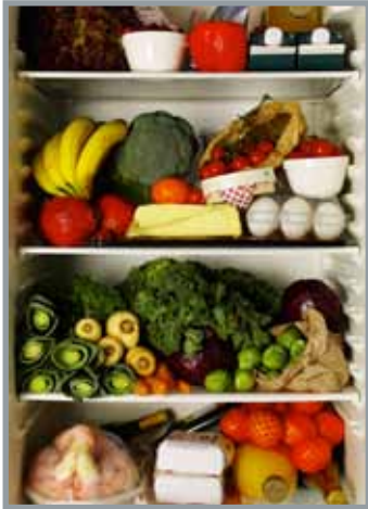
Bananas, apricots, oranges, cantaloupes, apples, potatoes, sweet potatoes, spinach, zucchini and tomatoes are all high in potassium.

Saturated fat is found in foods from animals, such as fatty meats, whole milk, butter, cream, and other dairy foods made with whole milk. It also includes tropical oils (palm, palm kernel, and coconut). Trans fat is found in all foods made with hydrogenated oils. It may be in fried foods, crackers, chips, and foods made with shortening or stick margarine.